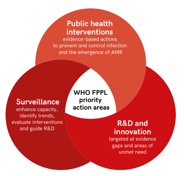
Fig. 2. Proposed priority areas for action

AMR: antimicrobial resistance; R&D: research and development; WHO FPPL: World Health Organization fungal priority pathogens liet